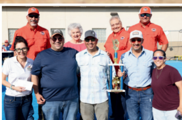
Jefferson - Los Jefferson Cowgrillers 2nd Place Fajita