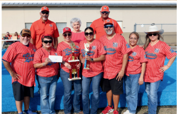
Guerra - Guerra Grillers 2nd Place Charro Beans