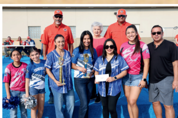
Gorena - Smokin Thundercats 4th Place Chicken