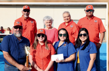
M&F Grillers 5th Place Ribs