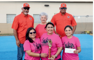
De La Vina - DLV Sizzlers 5th Place Charro Beans