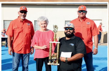
Vela - Gatos Asados 1st Place Chicken