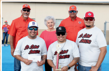
Barrientes - So Slow Smoking 4th Place Charro Beans