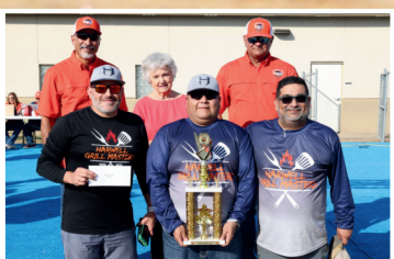
Harwell Middle School 3rd Place Chicken