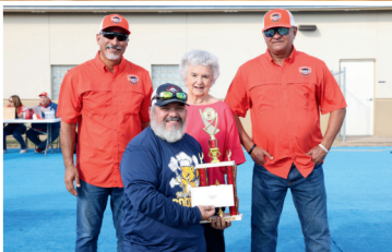
Magee - Magee Meat Masters 3rd Place Charro Beans