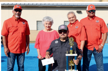
ECISD PD - Blue Smoke 3 3rd Place Fajita