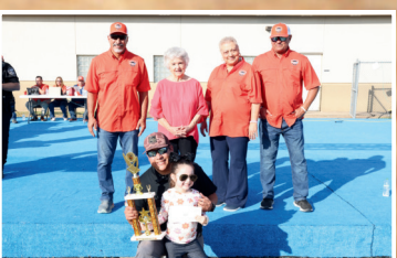
Gorena - Smoke Busters 3rd Place Ribs