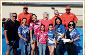
Gorena - Smokin Thundercats 5th Place Fajita