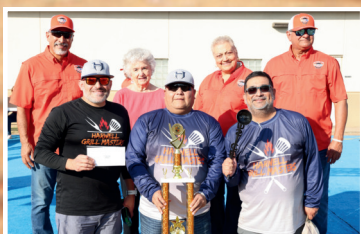
Harwell Middle School 1st Place Ribs