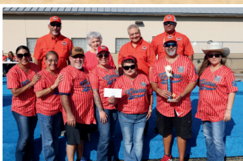
Guerra - Guerra Grillers 4th Place Fajita