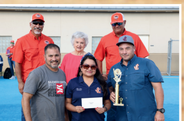
JEHS - Blazin' BBQ 5th Place Chicken