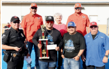
ECISD PD - Blue Smoke 1 1st Place Charro Beans