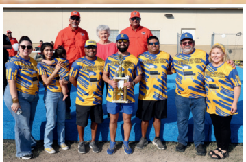
Longoria - Panther Posse BBQ 2nd Place Chicken