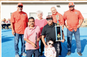
Gorena - Smoke Busters 1st Place Fajita