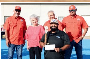
Vela - Gatos Asados 4th Place Ribs