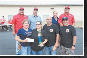
Team Jag BBQ 4th Place Fajita