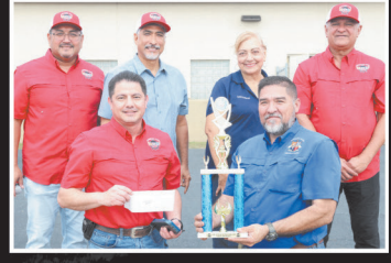
M&F Grillers 3rd Place Fajita