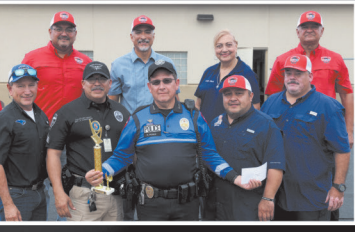
Blue Smoke #1 4th Place Chicken