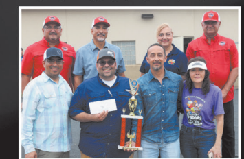
Los Jefferson Cowgrillers 3rd Place Ribs