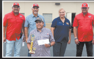
Smoke Busters 5th Place Chicken