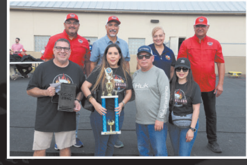
Lynx Grillers 1st Place Fajita