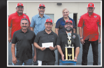
Assets on Fire 3rd Place Chicken