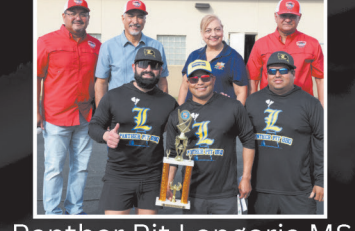
Panther Pit Longoria MS 3rd Place Charro Beans