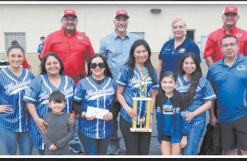
Smokin Thundercats 2nd Place Chicken