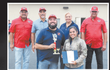
Smokin' AVE JAGS 5th Place Ribs