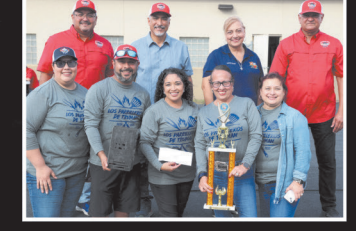
Los Parilleros de Truman Elem 1st Place Charro Beans