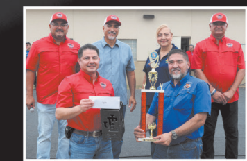
M&F Grillers 1st Place Ribs