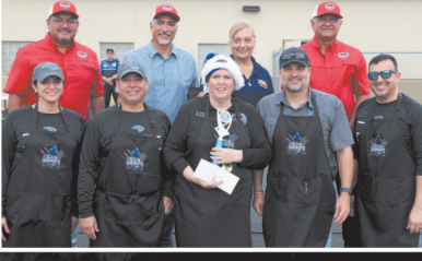
Sizzling SaberCats 5th Place Fajita