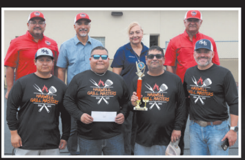
Pit Masters 4th Place Ribs