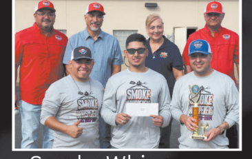
Smoke Whisperers 5th Place Charro Beans