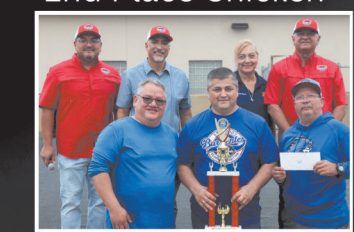
Pit Pros 2nd Place Ribs