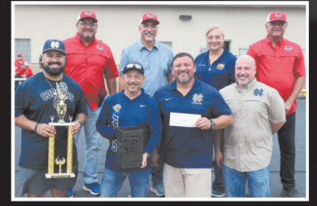
Game Day Grillers 1st Place Chicken