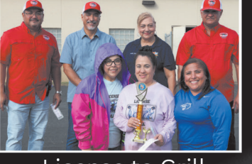
License to Grill 4th Place Charro Beans