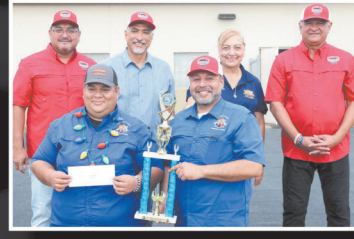
Road Kill Grillers 2nd Place Fajita