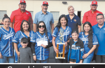
Smokin Thundercats 2nd Place Charro Beans