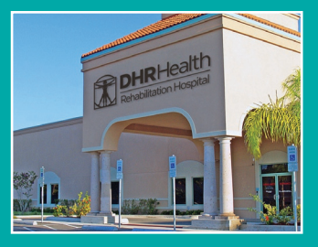
Favorite Rehabilitation Facility DHR Health Rehabilitation Hospital