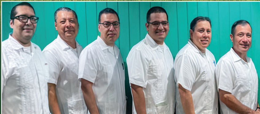
Pepe's Restaurant Waitstaff

117 S. 77 Sunshine Strip Harlingen, Texas