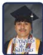
Brown University Major: Mechanical Engineering