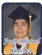
University of Texas at Austin Major: Computer Science