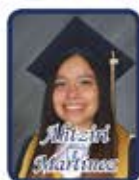
Valedictorian University of Texas at Austin Major: Architecture