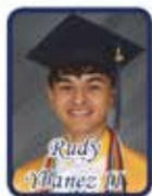
Fordham University Major: Dance