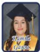
University of Texas Rio Grande Valley Major: International Business