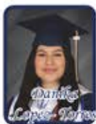
University of Texas Rio Grande Valley Major: Integrated Health Science