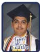
Stanford University Major: Mechanical Engineering