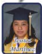
Salutatorian Rice University Major: Neuroscience