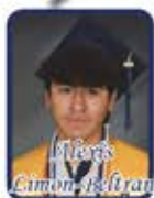
University of Texas at Austin Major: Computer Science