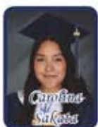
University of Texas at Austin Major: Accounting