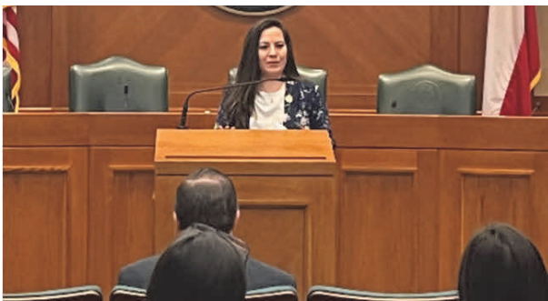
Rep. Gámez speaking with advocates about the importance of public education. Rep. Gámez laying out her HB 1538 to help disabled veterans with parking.

Rep. Gámez is also co-authoring legislation that would provide retired teachers with a cost-of-living- adjustment or COLA with Rep. Canales (HB 312).