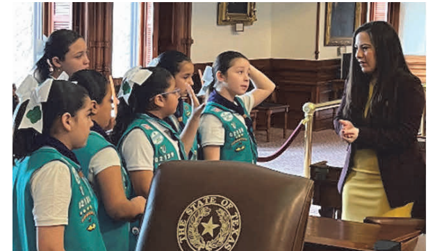
Rep. Gámez speaking with a local Girl Scout troop at the Capitol.

Rep. Gámez also filed multiple bills to continue to develop the workforce and businesses in our community. Those bills include: HB 2058 - creating a skilled labor taskforce in Cameron County; HB 2282 - developing the international bridge area in Brownsville; and HB 2598 - soft